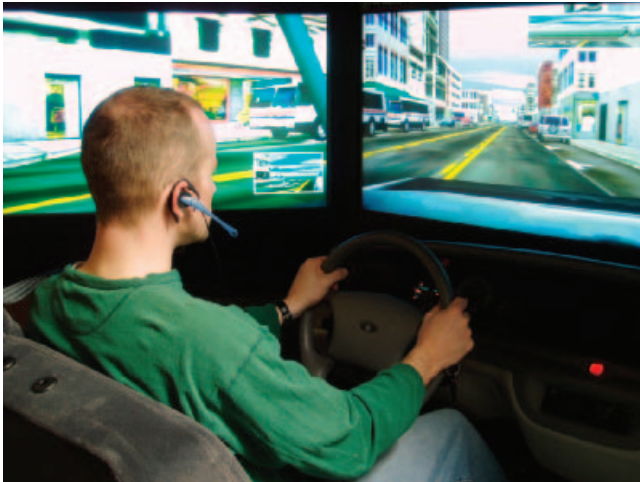
Fig. 1. A participant talking on a hands-free cell phone while driving in the simulator.

traffic-scenario, and road-surface software to provide realistic scenes and traffic conditions. We monitored the eye fixations of participants using a video-based eye-tracker (Applied Science Laboratories Model 501) that allows a free range of head and eye movements, thereby affording naturalistic viewing conditions for participants as they negotiated the driving environment.